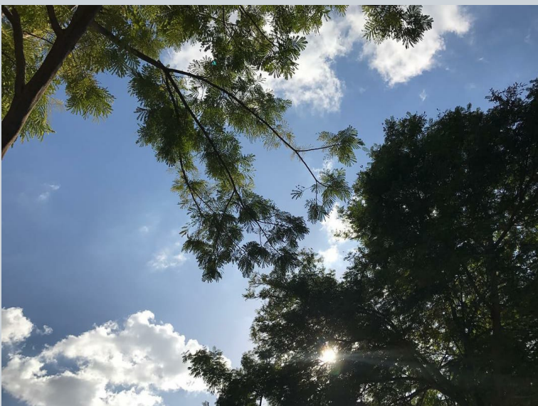
MADE BY-RUBA HUSSAIN 12-D