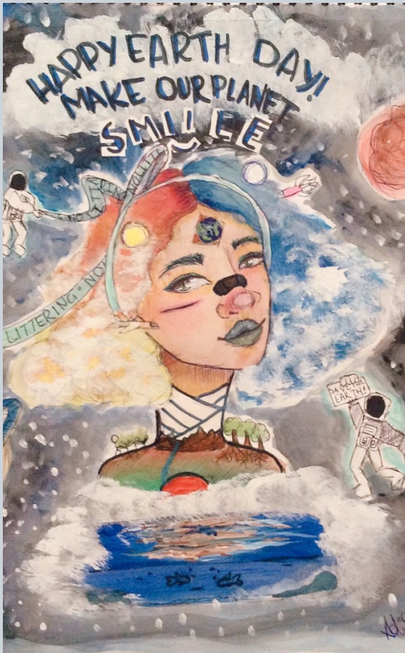
BY-ADITI SHARAN 8-H